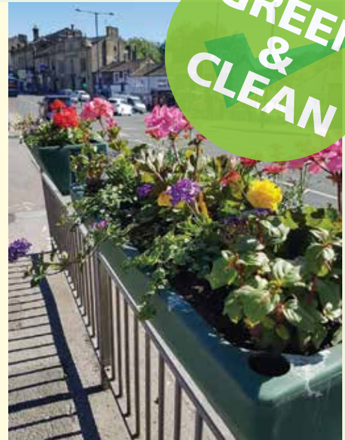
Bingley Main Street flowers in bloom

Next litter pick is 11th November, Market Square, 8 am – 10 am See Bingley Town Council website and facebook page for details.