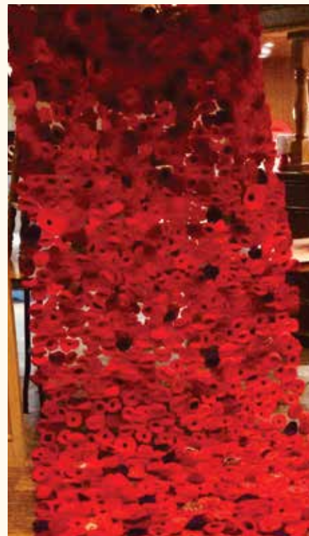
Knitted poppies by Bingley Women's Institute

Please contact us if you'd like to help.