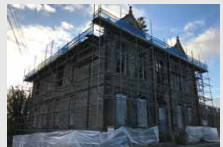
Scaffolded Priestthorpe Annex

Last year, following inquiries by the Town Council, Bradford Council revealed the building was beyond economic repair and had to be demolished. Bradford agreed to deal with issues of the covenant which restricted the building's use and it was put up for sale. The proceeds of the sale must be used for the 'educational benefit of the people of Bingley' and Bradford Council has promised to consult on how this will be best achieved. The founders' stone and a time capsule, buried in the foundations, will also be kept.