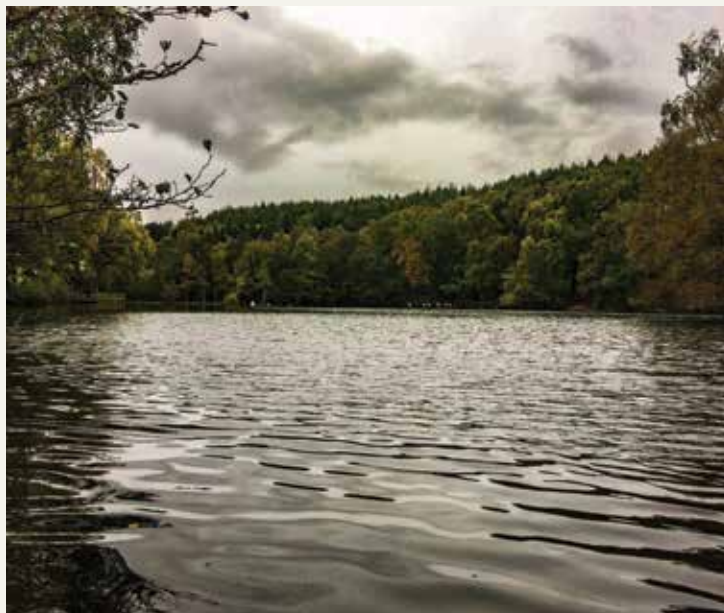
Autumn at St Ives, Bingley