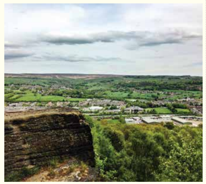
View from Druids Altar Rocks, St Ives Estate, Bingley

You can also add your organisation's event to the online calendar.