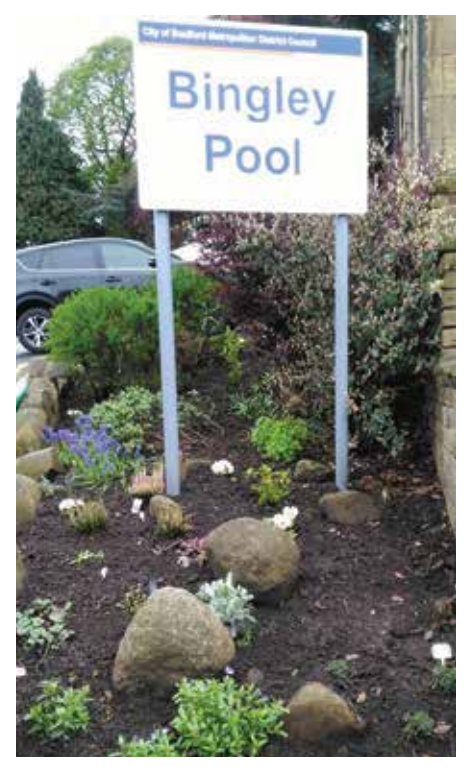
Bedding plants at Bingley Pool

Their work is highly appreciated and we hope they continue to improve our town centre for all to enjoy.