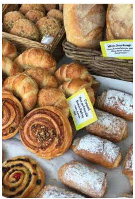
Fresh breads & pastries for sale at Bingley summer market

The new summer markets are a great success with lots of positive feedback.