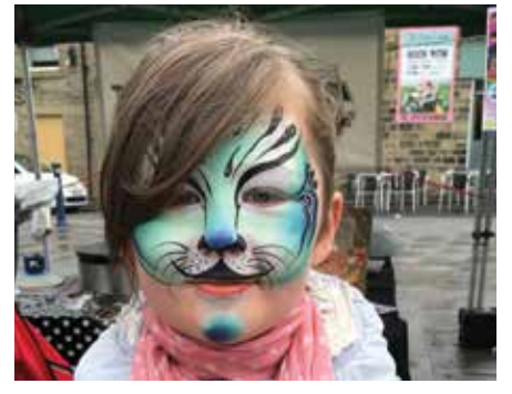
Face painting at the market

boards are positioned by Bingley Railway Station and in Jubilee Gardens and are the first step in the Council's efforts to promote Bingley as a destination for visitors and businesses.