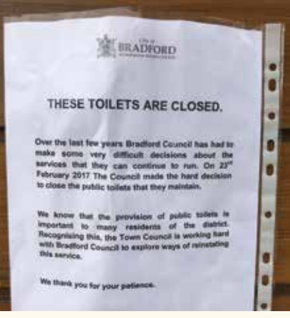
Notice on the toilets

In parallel, the Council is seeking an initial costing for project