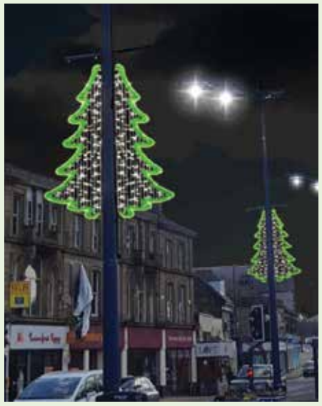
Bingley Christmas lights

Bingley Town Council are a holding a competition for schools in Bingley to design a Christmas light decoration. This will be placed on the lamppost at the corner of the market square