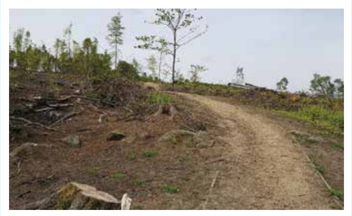
Betty's Wood where the Council grant will pay for new planting

A grant of £835.60 was awarded to the Friends of St Ives towards the cost of spring-flowering, native trees and shrubs to be planted along a pathway in Betty's Wood at St Ives. This is to mitigate the effects of the recent felling of over 1,000 trees owing to the presence of a disease called Phytophthora Ramorum.