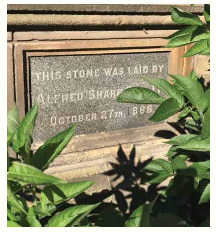
Priestthorpe Annex Founders' stone

for around £250,000 and the Town Council has been reassured by the Trustees that the entire proceeds will benefit Bingley and views will be invited on how the proceeds should be distributed. In addition, the plaque commemorating the building's founders will be preserved.