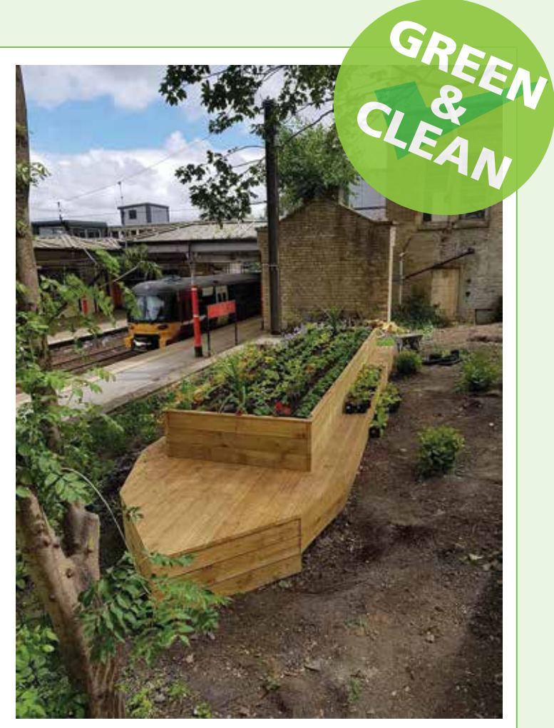
Action Stations Five-Rise garden taking shape

This includes the Action Stations group, which, in addition to planters at both Bingley and Crossflatts railway stations, is busy creating its Five-Rise-themed garden at Bingley complete with a canal boat planter.