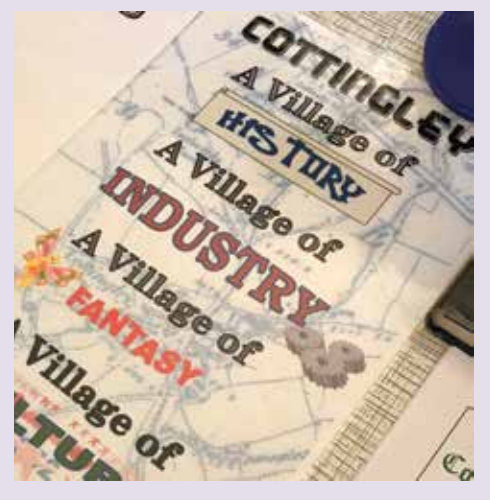
Clockwise from left: Staff from HALE helping young people in Bingley, Bingley Belles launch flyers, Cottingley Village History Society leaflet