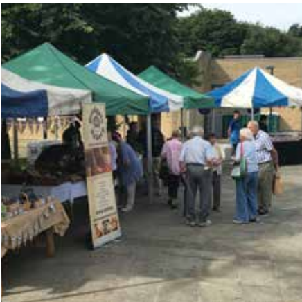
Market stalls in Bingley

6th April, 4th May, 1st June, 6th July, 3rd August, 7th September, 5th October, 2nd November, 7th December.