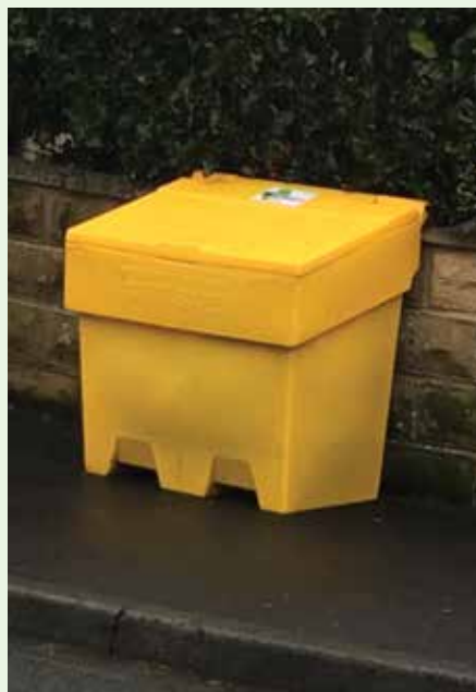
New grit bin in Bingley

Please look out for elderly neighbours who may struggle to get to their nearest bin and offer to help if you can.