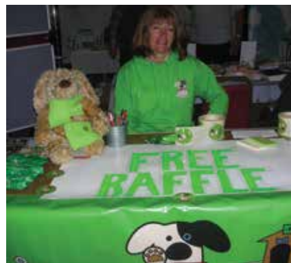
Working towards a dog poo free Bingley