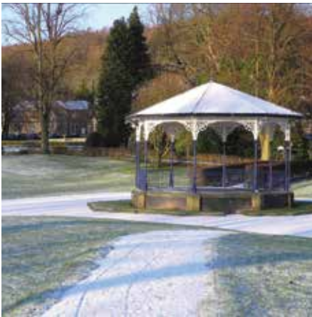
Myrtle Park.

Bingley Camera Club were awarded £500 towards a laptop which will be used at the Yorkshire Photographic Union Exhibition. This prestigious event will be held at Bingley Arts Centre from May 4th - 19th 2019.