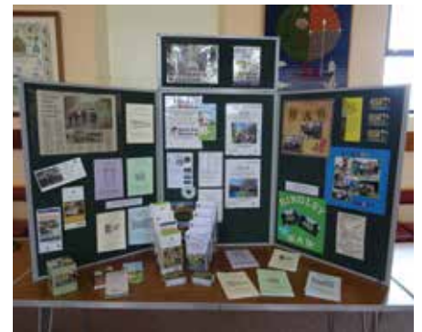
Top: Enjoying the new projector at Cottingley Community Centre. Bottom: Walkers Are Welcome received a grant to host the Regional Conference