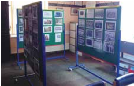
Cottingley Village History Society display boards

Cottingley Village History Society received a grant of £451, which was used to buy display screens, A boards and sign holders for the Cottingley Heritage Centre. The centre is open to visitors from 6th April to 28th September on Saturdays from 10.00 a.m till 12.00 noon.