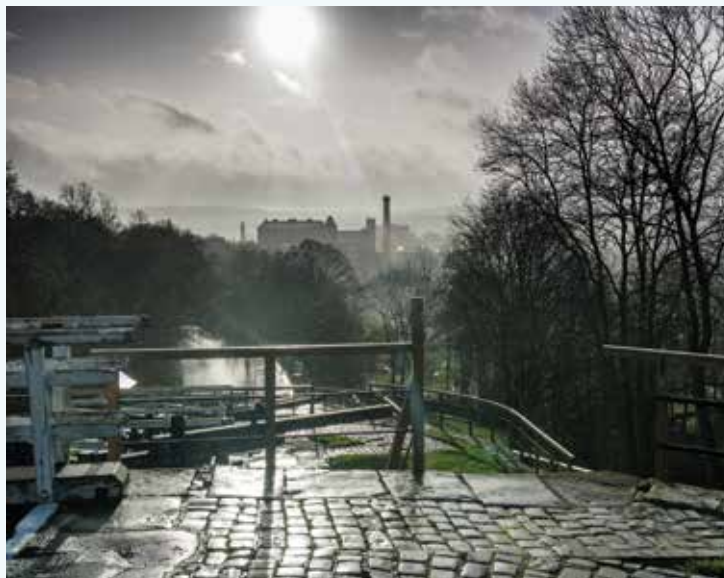
Bingley from Five Rise Locks