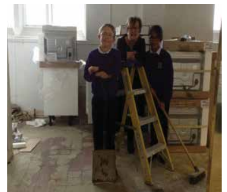
Developing Trinity Kitchen

Trinity All Saints Primary School received a grant of £2000 to help the development of a Community Kitchen. This will be used by school pupils and community groups to encourage healthy eating and provide cooking experience. We look forward to seeing the kitchen in action.