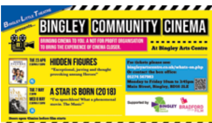
Bingley Community Cinema poster

It is a very welcome addition to the cultural and social life of our town.