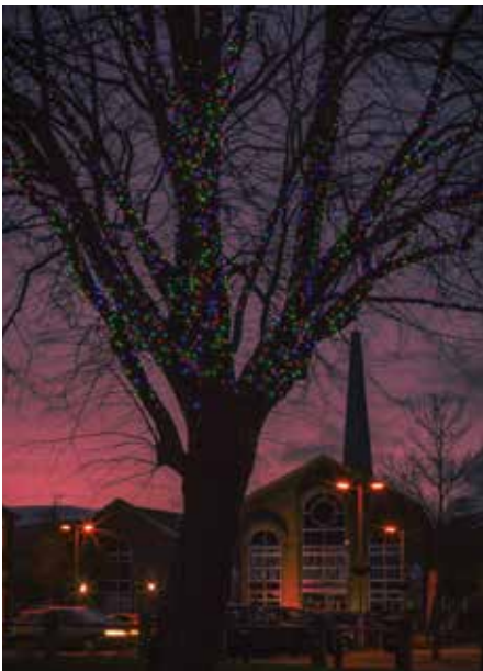
Cottingley Christmas Lights.

Cottingley Community Association received a grant of £1782 for new Christmas lights in the village.