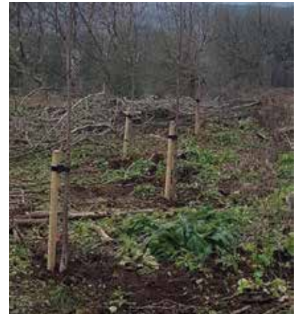
New trees at Betty's Wood at St Ives

A fantastic team of volunteers turned up in January to help replace trees in Betty's Wood at St Ives Estate. Trees were purchased with a grant of £835.60 from Bingley Town Council.