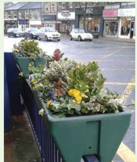
Winter floral displays throughout Bingley