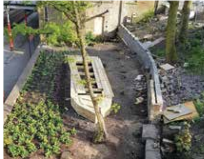
Bingley Station garden with barge planter

A Five Rise Locks themed garden is under construction at Bingley railway station, thanks to Bingley and Crossflatts Action Stations group.