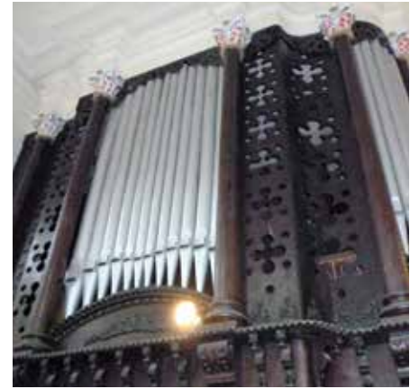
Cottingley Town Hall organ pipes

There was a free concert on 2nd February 2019 with four local organists playing their own choice of light music. The building will be open from 10 a.m. to 12.00 noon throughout April to September with an open invitation to come and