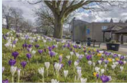
Bingley Town Centre

Work is underway on the initial draft of a new Neighbourhood plan for Bingley.