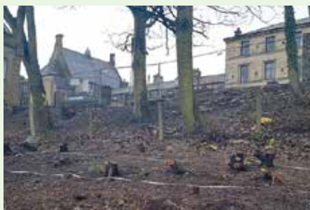
Barge shaped plot in the themed garden

The main feature of our garden will be a giant wooden planter, shaped and painted colourfully like a canal boat. There will also be 5 giant posts rising out of the ground, ascending in height to represent the Locks, and these will be decorated with bird and bat boxes and bug hotels, made by local children. There will be a rich tapestry of planting and we hope to create a haven for wildlife.