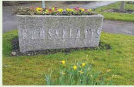
Flower displays at Crossflatts