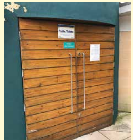
Bingley Public Toilets

In short, the situation is complex and the Town Council is doing its very best to work through all the options and arrive at a sustainable, affordable and reasonable solution for our community.