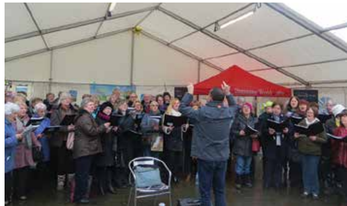
Hopes are high for the next event which is the Bingley Canal Festival on Saturday 19th May. Put the date in your diary.