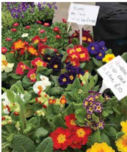
Plants & flowers for sale at Bingley market

Please support and enjoy our five new monthly markets! They'll be held over the summer months in the town square.