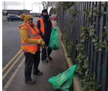
Cleaning up at Bingley railway station

The next litter picks are on Saturday 14th April in Cottingley and Saturday 16th June, location tba. The Town Council supported St Joseph’s Primary School and East Morton Cub Pack to run their own litter picks in Bingley at the end of March. And meanwhile, the number of Green and Clean Champions continues to grow; we are now up to 23! It’s wonderful to have the help of so many community-minded people. Get in touch if you would like the use of your own litter picker, gloves and a supply of refuse sacks to help keep rubbish at bay.