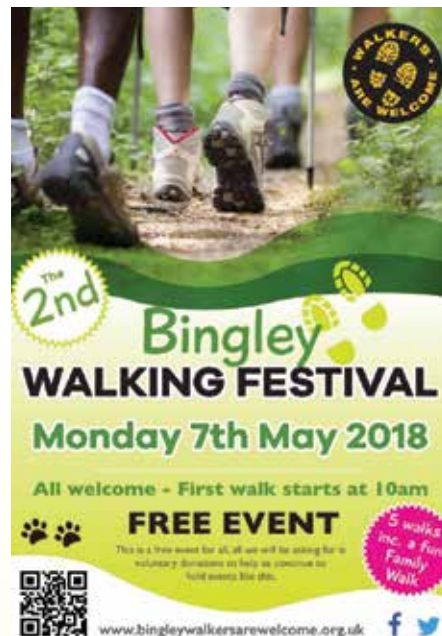
Walking Festival flyer

This year's Annual Town Meeting will be held on April 26th 2018 at Bingley Methodist Church Hall, Herbert Street BD14 4NU from 6.30 – 8.00 p.m. All are welcome. Community groups which have benefited from grant awards in 2017-18 will be there to give feedback on how the grants have been used.