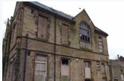
Priestthorpe Annex, Bingley

Residents voiced concern that Bradford Council had made no investment in the building, allowing the roof to be removed and sold in