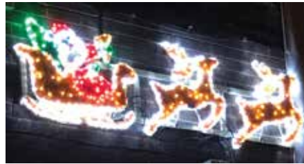
Cottingley Village Lights

It's hoped next year to have more lights in Bingley and surrounding