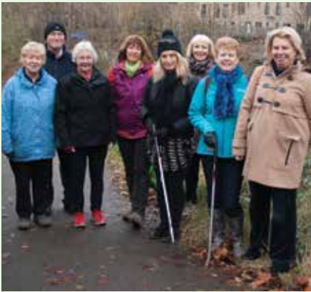
Photo: Champions

Bingley has 17 Green and Clean Champions! Who are they and what do they do? The short answer is that they are residents who care greatly about their town and are willing to spend their own time working independently to help keep Bingley free of litter.