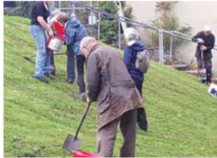
Bulb planting by Bingley Airedale Rotary Club

appear on the site in spring have been planted to raise the profile of Rotary's worldwide objective to eradicate polio. Purple has been chosen because it is the colour of the dye used to identify children who have been vaccinated against the polio virus. Not content with this, on 27 November Rotary members also planted 200 daffodils on the corner patch of Quaker Hill opposite the Aldi store.