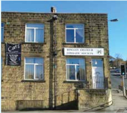
Bingley Amateur Operatic Society

In the latest round of Grant Applications, the following groups were awarded funding by Bingley Town Council: