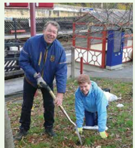
Bulb planting at Crossflatts station

See the Action Stations noticeboards at both Bingley and Crossflatts stations for how you can get involved. All are welcome!