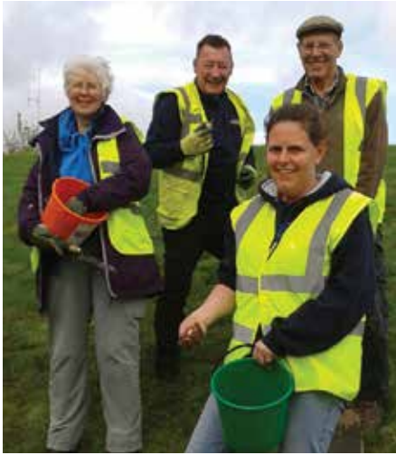
Bulb planting Ferncliffe banking

Local groups from across the parish have taken advantage of the Town Council-subsidised winter bedding plants and spring bulbs for an opportunity to add seasonal colour to their own areas. In addition, a community bulb-planting session was held on 21st October, when crocuses and daffodils were planted on the banking on Ferncliffe Road by the sliproad to the A650 bypass.