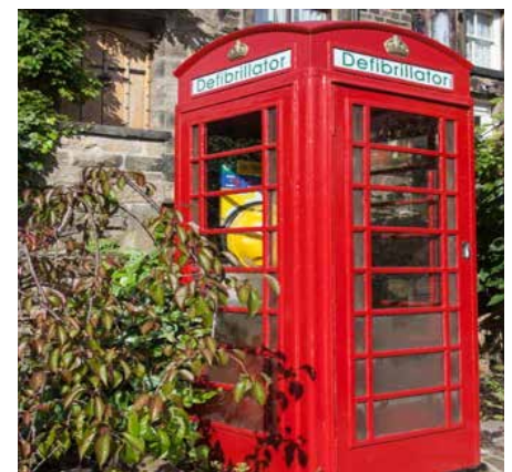
New defibrillator at Micklethwaite

Public consultations events were held in Bingley on 2nd and 16th December 2017 so that residents could see plans of the Town Council's proposed scheme and get full information about the financial implications. All supporting information was posted on the Town Council's website and placed in Bingley Library and Cottingley Cornerstone, and residents were asked to complete a survey to give their responses to the plan. The Council will now analyse the results and decide a way forward.